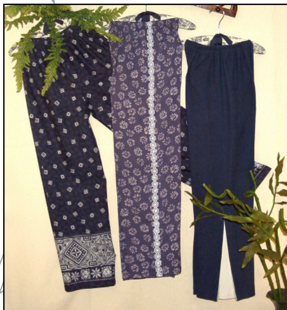
Plain - Side Seam Trim or Box Pleat Insert

Measuring and Fitting Instructions Included