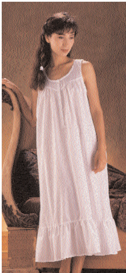
Misses' nightgown has front tab closure. Gown is gathered to front and back yoke. Neckline and arm-holes are finished with narrow lace and self fabric binding. View A has ruffle at the bottom edge. View B has bottom edge finished with lace.