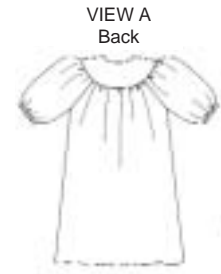
VIEW A Back