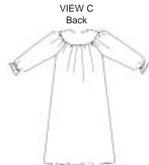
VIEW C Back

Misses' duster and nightgown have raglan sleeves and a round double yoke. View A and B duster have front button or snap closure, short sleeves with elastic, and pockets. View C pull-over nightgown has long sleeves with elastic at wrists.