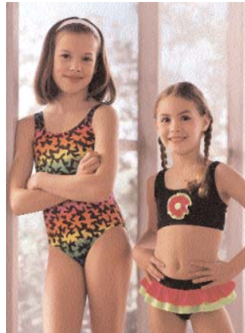
Girls' swimsuits. View A tank style swimsuit has scoop neckline. View B tank style swimsuit has ruffle at hips. View C two-piece swimsuit pull-over top with decorative flower from contrast fabric, panties have double ruffle from contrast fabric. All outside edges of all views are finished with elastic.