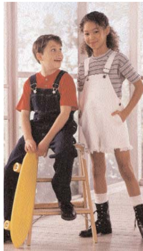
Boys' and Girls' loose fitting bib overalls have side pockets, bib pocket, shoulder straps with buckles, side openings with button closures, back pockets and optional fly zipper. View A has side patch pocket on right back and hammer loop on left back. View B has hemmed short legs. View C shorts are fringed on bottom edges of legs.