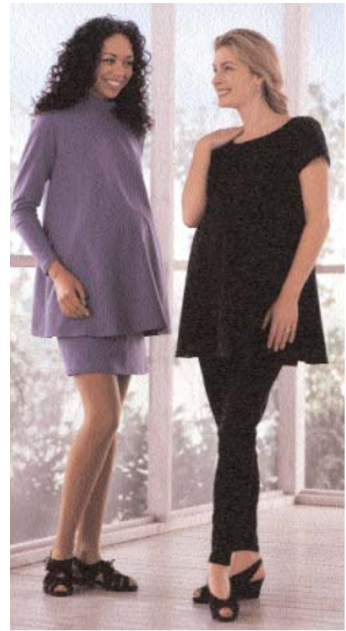
Maternity pants, skirt, dresses and tunics. Pull-over dress and tunic – View A has collar and long sleeves, View B has scoop neckline and short sleeves, tunics have side hemline slits. Pull-on skirt and pants have wide waistband without elastic.