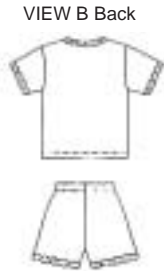
VIEW B Back