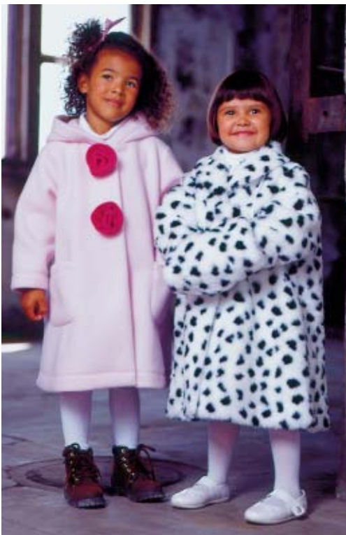
Toddlers' coats. View A unlined coat has hood, patch pockets and snap or Velcro closure and decorative flowers from contrast fabric. View B lined coat has shawl collar and self fabric buttons. Muff is lined and has polyester batting.