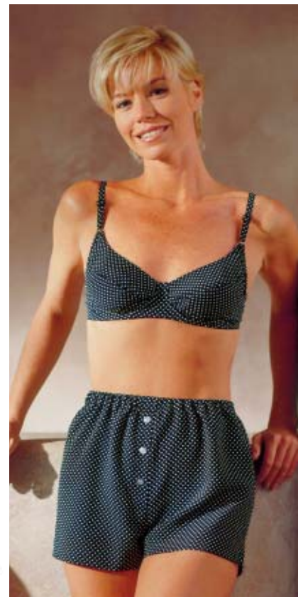
Misses' boxer shorts and bra. Pull-on shorts have elastic in casing at waist and side hemline slits. View A has fake fly with decorative buttons. Bra has underwires, lined cups, adjustable self fabric straps and hook bra fastener on back.