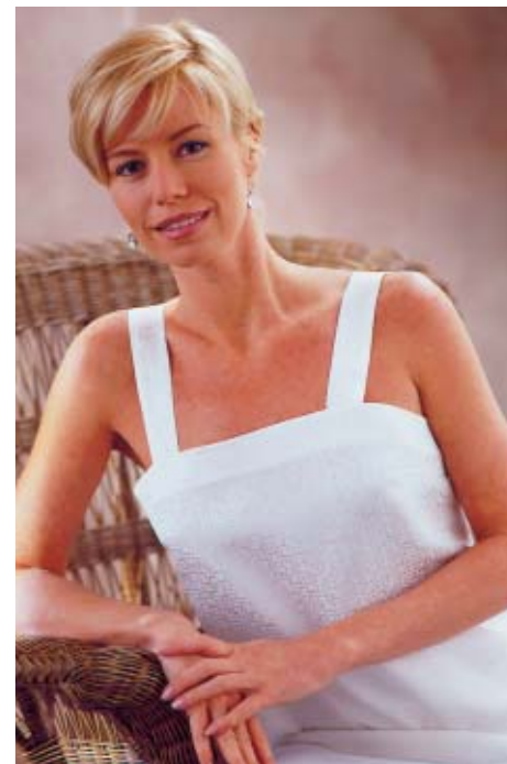
Misses' camisoles. View A pull-over tank top has neckline and armholes finished with narrow hems. View B cropped tank top has button closure on front, and neckline and armholes are finished with narrow hems. View C has bust darts, wide shoulder straps, facing at top edge and button closure on back. View D pull-over style has spaghetti straps, bust darts, V-shaped neckline and facing at top edge.