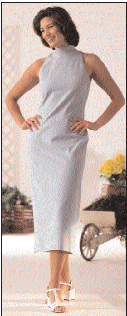
Misses' close fitting pull-over dresses have center back seam. View A and B tank style dresses have neckline and armholes finished with self fabric binding. View C "halter" style has mock turtleneck and armholes are finished with self fabric binding. View B and C have straight skirt with hemline slit at center back.