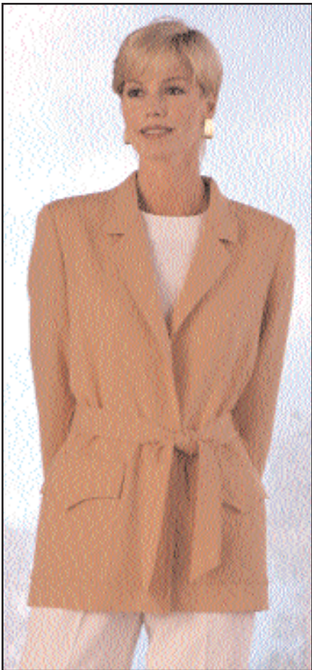
Misses' straight unlined jackets without closure have shoulder pads, collar and lapels. View A jacket has welt pockets and fold-up cuffs. View B has patch pockets with flaps with optional buttons, belt loops and tie belt.