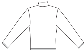
VIEW C Back