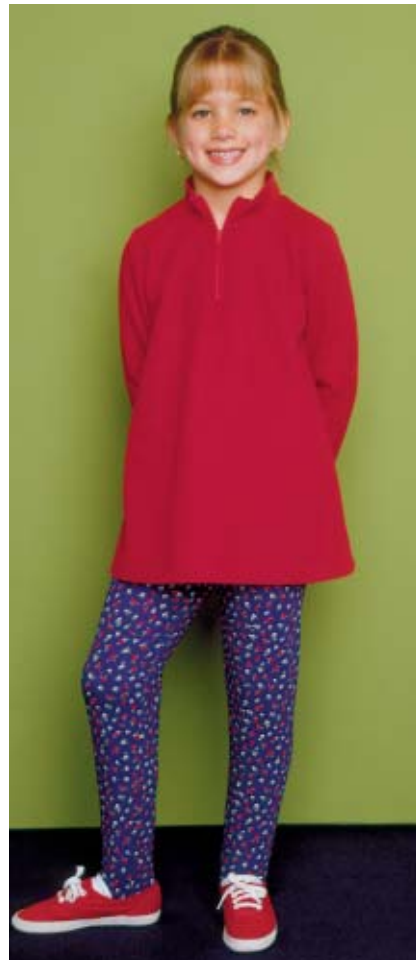
Girls' leggings, shorts and flared tunics. Pull-on leggings and shorts without side seams have stitched elastic at waist. View A have stirrups, View B are hemmed, View C are shorts. View A tunic has zipper on front, collar, and long sleeves. View B tunic has round neckline finished with facings, back neckline slit with one button and loop closure and short sleeves.