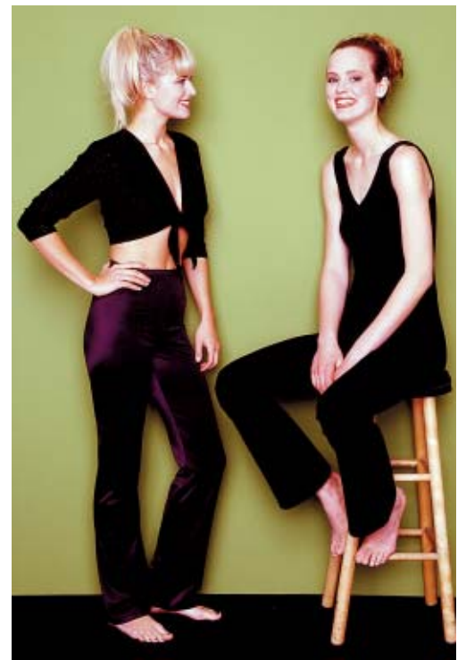
Catsuit Pattern #2633

Misses' very close fitting pants, tops and leotard. Pants, without side seams, have stitched elastic waist, and legs are flared at bottom edges. Cropped top has low V-neckline and ties under bust. Leotard has scoop neckline and all outside edges finished with elastic.