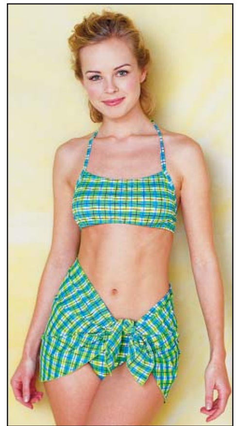
Misses' two-piece swimsuits and wrap. View A lined halter-style top has hook closure on back and ties at back neckline. Boy leg panties have partially lined front and all outside edges of swimsuit are finished with elastic. View B lined halter-style bra has hook closure on back and ties at back neckline. Bikini panties have lined front and all outside edges of swimsuit are finished with elastic. Wrap has all outside edges finished with narrow hems.