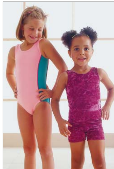
Girls' leotards, leggings and shorts. Capri length leggings and shorts, without side seams, have elastic waist. Leotards with scoop neckline have all outside edges finished with elastic. View B has princess lines and side panels with piping from contrast fabrics.