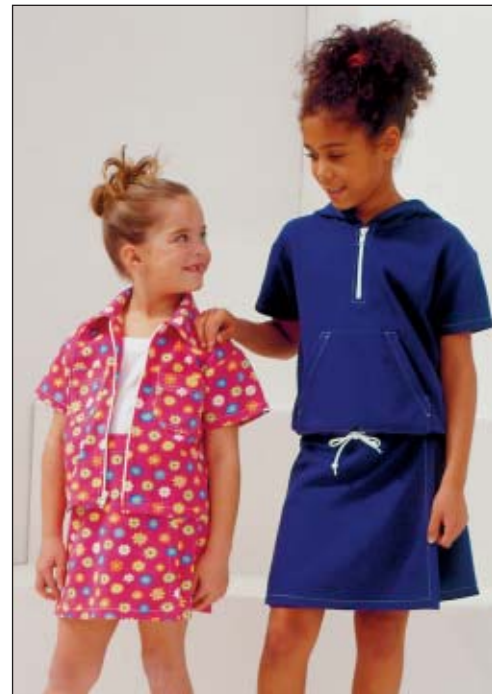
Girls' skort and tops. Pull-on skort has waistband with elastic in back. View A pullover top has long sleeves, zipper on front, hood, patch pocket and drawstring at bottom edge. View B top has front zipper, collar, patch pockets and short sleeves.