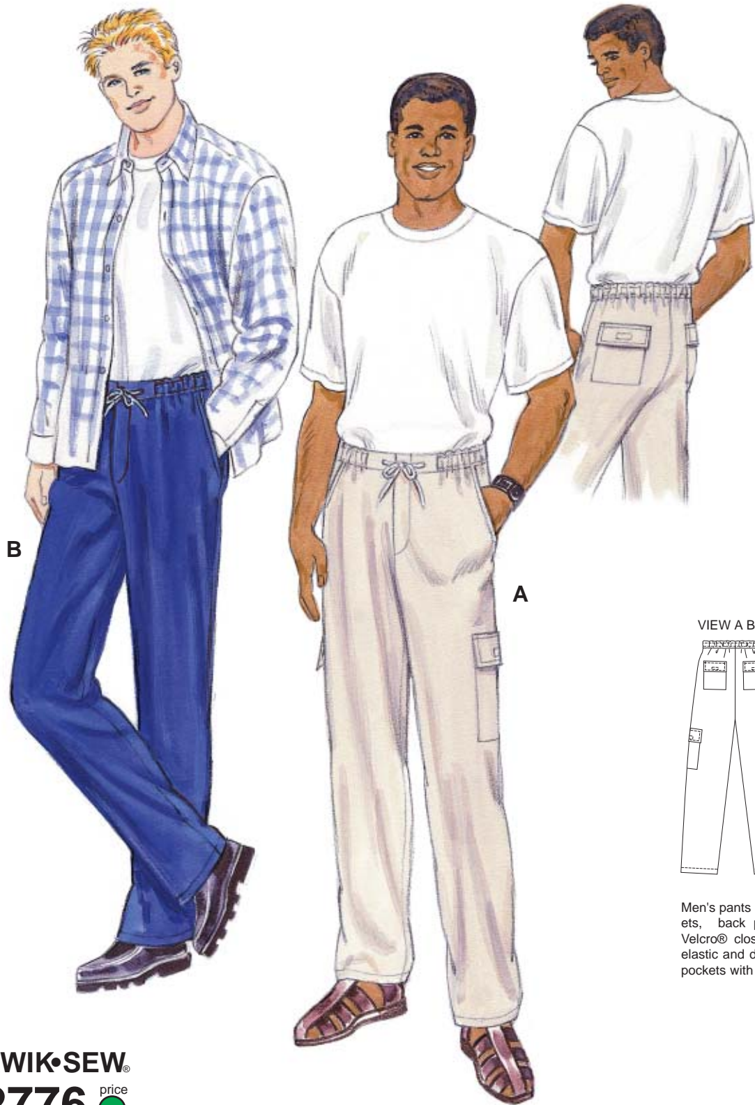
VIEW A Back