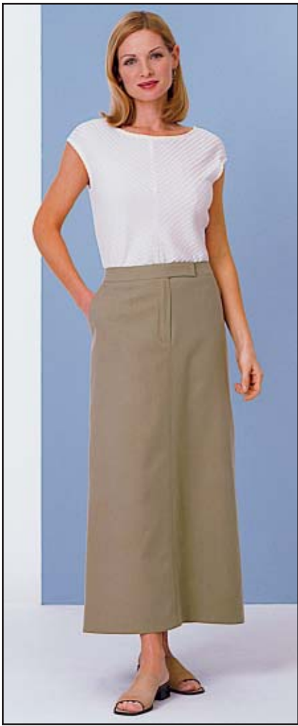
Shown with Top 2781

Misses' fitted trouser style skirt in three lengths. Skirt has fly zipper, optional front side pockets, low cut waist with shaped waistband and extension with hook and eye closure. View A has kick pleat at center back.