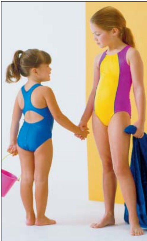
Girls' swimsuits have racing backs, low back waists, crotch lining, and all outside edges are finished with elastic. View B has front panel and piping from contrast fabrics.