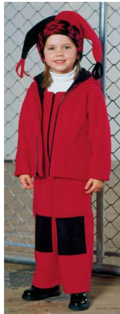
Hat Pattern 2710