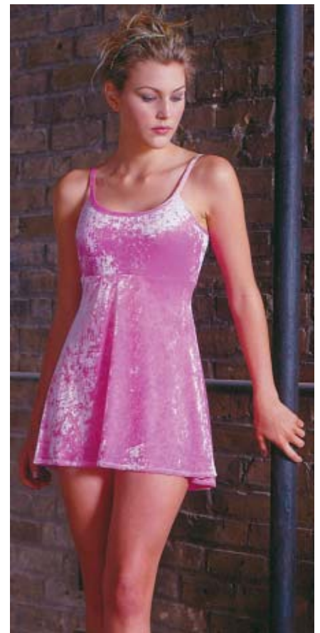
Misses' leotard with attached skirt from contrast fabric has empire waist, neckline binding and shoulder straps in one with elastic. Front bodice and crotch are lined and leg openings are finished with elastic. View B skirt has curved hemline - back is longer.