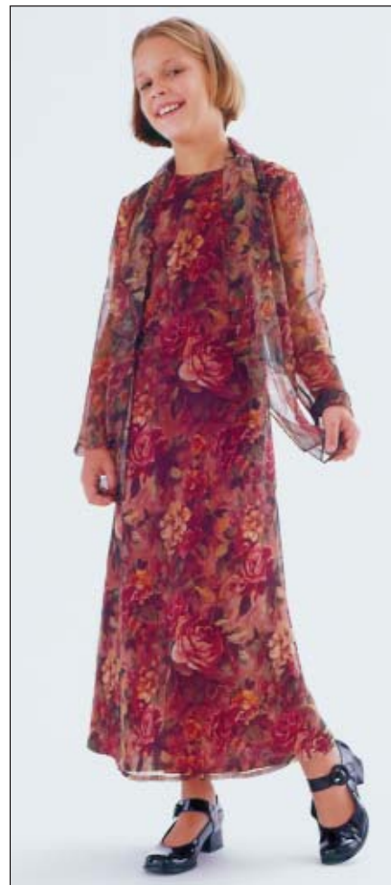
Girls' slightly flared pullover dresses have slit on back neckline with one button closure and ties on back. View A sleeveless dress has neckline and armholes finished with self fabric binding. View B and C have optional lining or if unlined, necklines are finished with self fabric binding. View B has short sleeves. View C has long sleeves and shawl.