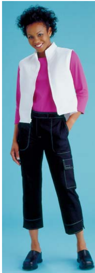
Shown with Vest #2843

Misses' fitted, cropped pants and shorts have fly zipper, low cut waist, shaped waistband, and side pockets stitched to front. View A and B have wide hem, hemline slits, and pants can be folded up for cuffs. View A has leg patch pocket with flap and Velcro® closure.