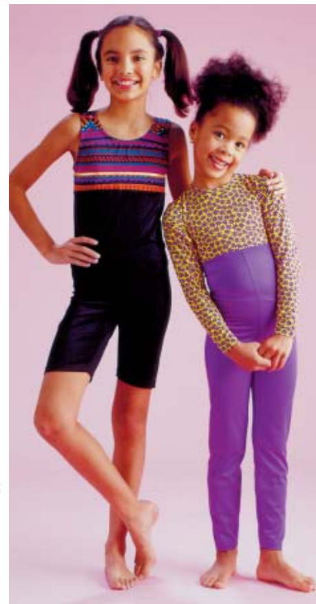
Girls' very close fitting unitards have empire waist with contrast fabric bodice. View A has full length legs, long sleeves, round neckline, keyhole opening on back; neckline is finished with self fabric binding and has hook closure on back neckline. View B and C have tank style bodice and neckline and armholes finished with elastics. View B has above knee length legs. View C has short legs.