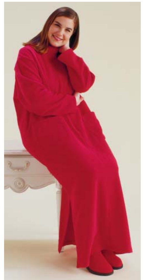
Women's robes have front patch pockets. View A pull-on robe has stand-up collar, zipper on front, side hemline slits and full length sleeves. View B has short sleeves, V-neck and fronts with facings and button closure.