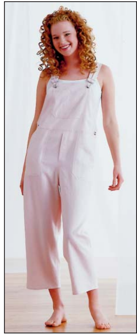
Misses' bib overalls in three lengths, have fake fly, front patch pockets, bib pocket, shoulder straps with buckles, side openings with button closures, back patch pockets and back belt with buckle.