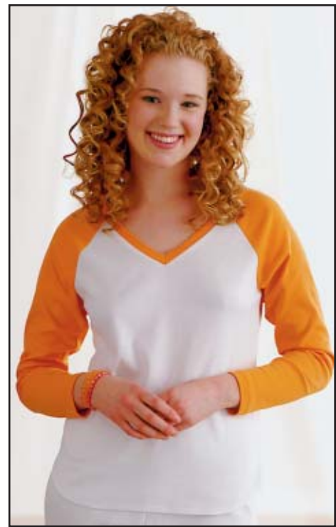
Misses' raglan sleeve tops. View A has round neckline with self fabric neckband. View B has wide V-neckline, shirt-tail hemline, and contrast sleeves and neckband. View C color blocked top has scoop neckline and flared sleeves.