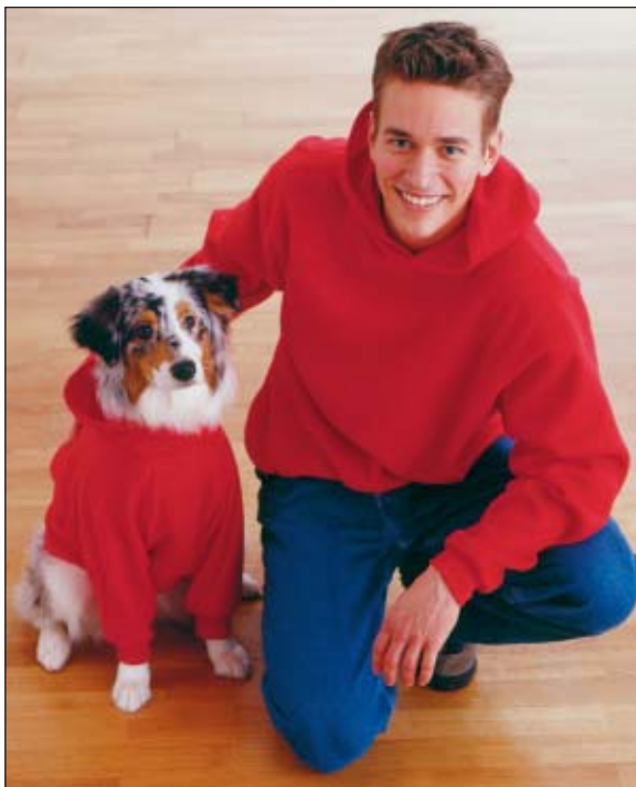
Men's Shirt #2234