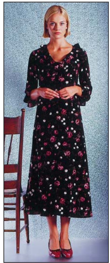
Misses' lined dresses have V-neckline, under bust seam, bust darts, flared skirt, and zipper at center back. View A has three-quarter length sleeves with circular ruffles, sleeves are not lined. View A and B have circular neckline ruffle. View B and C are sleeveless.