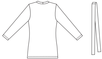
Cardigan VIEW B Back