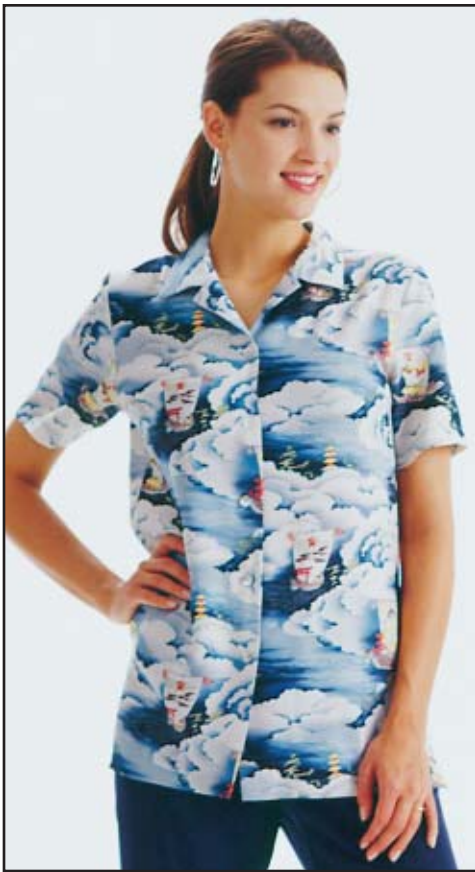
Misses' blouse has bust darts, collar and optional pocket. View A has long sleeves with cuffs. View B has short sleeves. View C has side hemline slits and short sleeves.