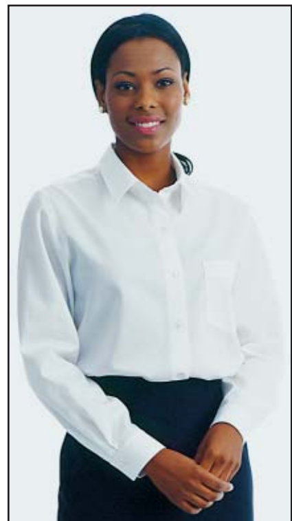
Misses' shirt has collar, collar stand, double yoke, optional breast pocket, and shirt tail hemline. View A has long sleeves with cuffs. View B has short sleeves.