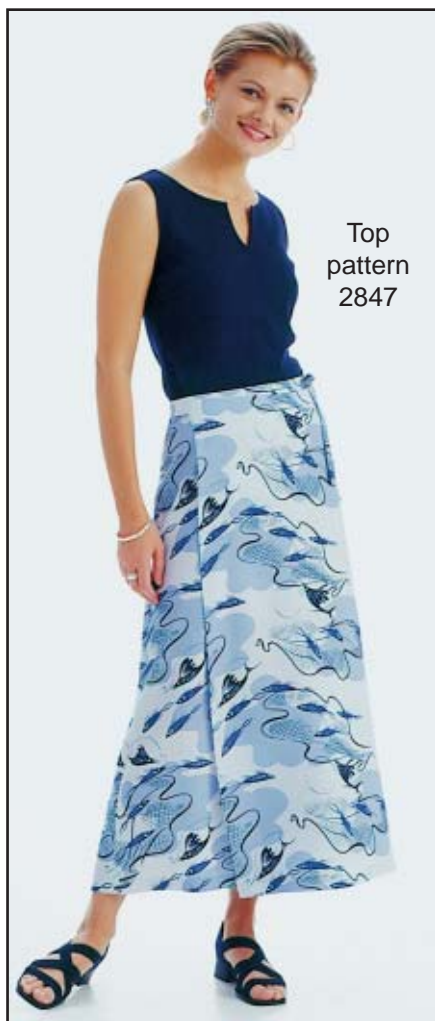
Top pattern 2847

ESPECIALLY DESIGNED FOR FIRST SEWING PROJECT!