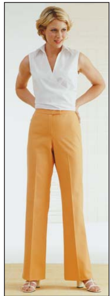
Shown with blouse # 2966

Misses' close fitting pants have fly zipper, low waist and hook and eye closure. View A and B have flared legs. View C has slim tapered legs.