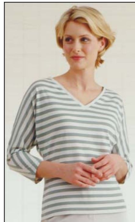
Misses' pull-over tops. View A has three-quarter length dolman sleeves and boat neckline with neckband. View B has cap sleeves and boat neckline with neckband. View C has three-quarter length dolman sleeves and V-neckline with neckband.