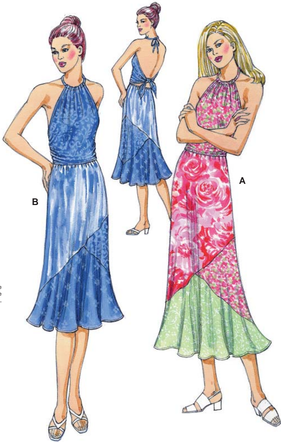
Misses' top and pull-on skirt in two lengths. Halter top in one piece ties in back and has hemmed outside edges. Neckline has casing with bias cut tie. Color blocked skirt has flounce, side inset, and narrow elastic in casing at waist.