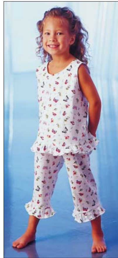
Girls' nightshirt and pajamas. View A pullover nightshirt has neckline and bottom of sleeves finished with stretch lace. View B and C pajamas have tank top with neckline and armholes finished with narrow hems. Pull-on pants, without side seams, have narrow elastic in casing at waist. View C has ruffles at bottom edges of Top and legs.