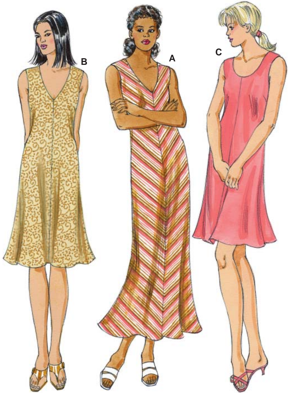
Misses' bias cut close fitting dresses are lined and have center front and center back seams. View A and B have V-neckline. View C has scoop neckline.