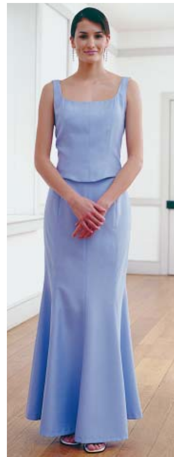
Misses' skirt and tops. Fitted flared skirt has eight panels, zipper at side seam, and waist is finished with facing. View A top is very close fitting with princess line seams, has shaped hemline, separating zipper at side seam and is lined. View B and C bustiers are very close fitting, have boning in front panel, back panel and right side seams, left side seam has a separating zipper. View C has decorative eyelets with ribbon at back.