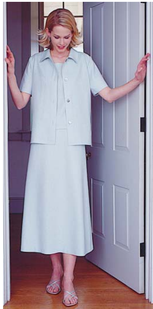
Misses' jackets, skirt and top. Jacket has convertible collar, stitched front facings, side hemline slits, and front button closure. View A has full length sleeves, View B has short sleeves. Pull-on, A-line skirt has elastic in casing at waist. Pull-over tank top has bust darts and neckline and armholes are finished with narrow hems.