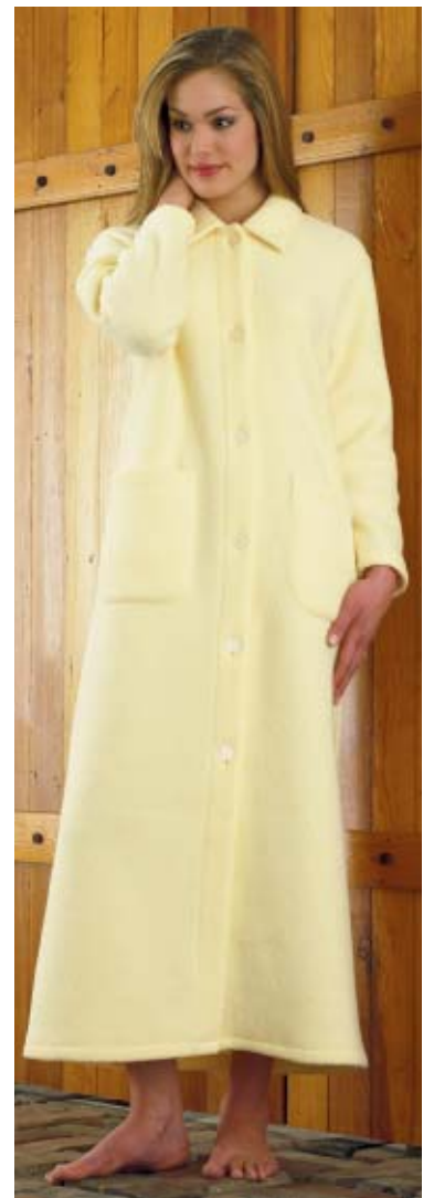
Misses' robes have front button closure, collar, extended shoulders and full length sleeves. View A has patch pockets. View B has pockets in side seams, belt loops and self fabric tie belt.