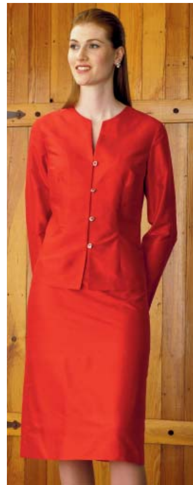
Misses' tops and skirts. Fitted top has bust and waist darts and loop and button closure. View A has round neckline with slit, and full length sleeves. View B has collar, front slit and short sleeves. View A and B fitted skirt has darts on front and back, zipper at center back, and a narrow waistband with hook and eye closure.