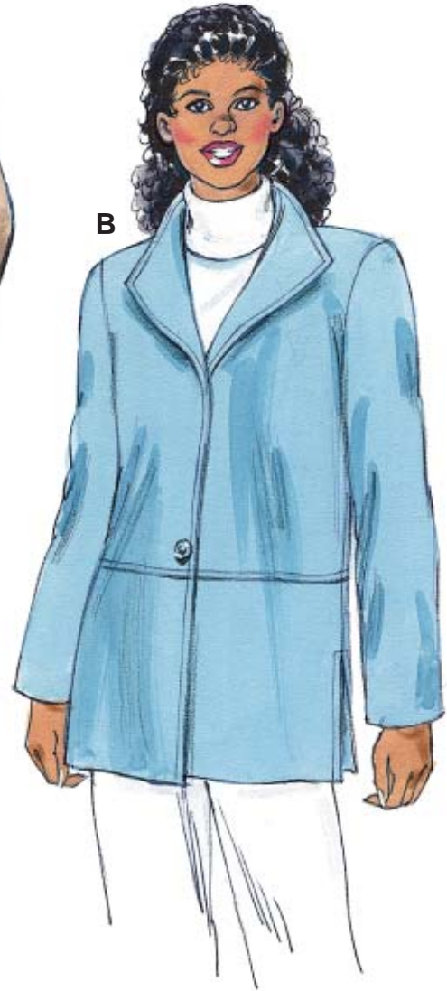
Misses' unlined jackets have stand-up collar on back, lapels and waist seam. View A has pockets in seams on lower front. View B has one button closure and side hemline slits.