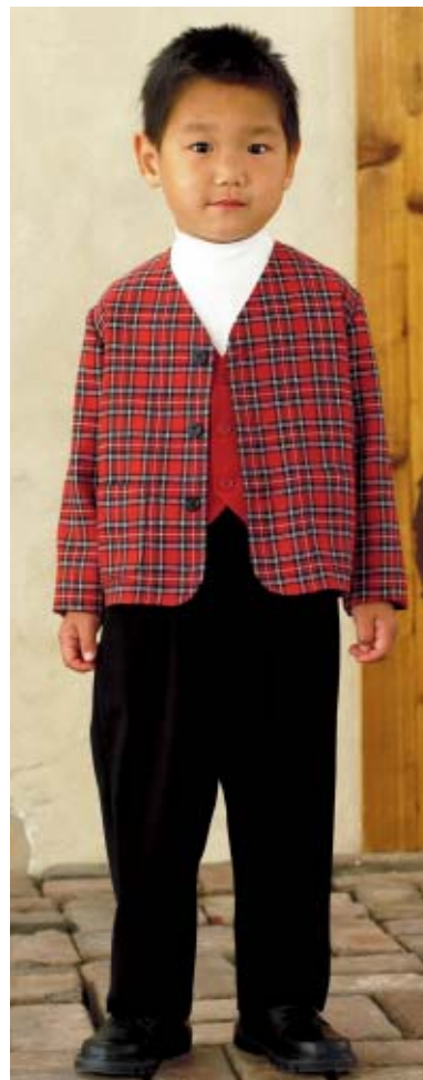
Toddlers' pull-on pants and shorts have front tucks, and waistband with elastic and flat front. Unlined jacket has patch pockets, and fronts and neckline finished with facing. Lined vest has lining back.