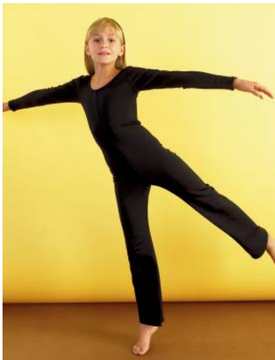
Girls' unitards, without side seams. View A has stand-up collar, front zipper extending into collar, and full length sleeves. View B and C have scoop neckline finished with elastic and flared legs. View B has full length sleeves, View C has short sleeves.