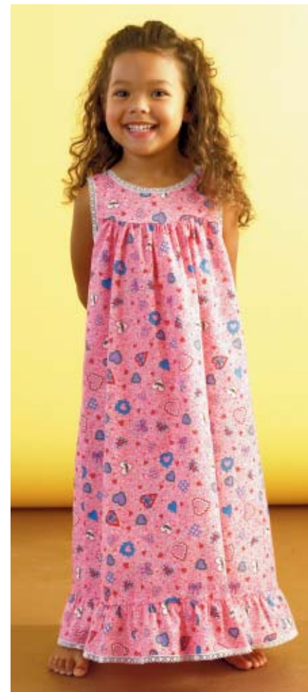
Girls' nightgowns have front and back gathered to yokes and ruffle at bottom edge. View A has double yoke with button closure, and gathered sleeves have gathering at wrist with elastic. View B has single layer yoke, and neckline, armholes and bottom edge are finished with lace.