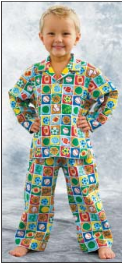
Toddlers' pajamas and tank top. Pajama shirt has long sleeves, front button closure, collar and patch pocket. Pants have side seams and elastic waist. Tank top has neckline and armholes finished with narrow hems.