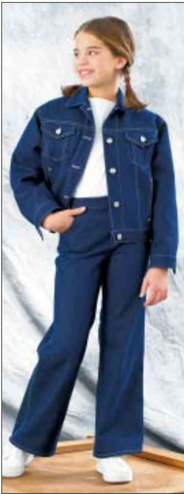
Shown with Jacket #3136

Girls' jeans have fly zipper, waistband with belt carriers, back yoke, back patch pockets, front pockets, and a change pocket. View A has straight legs, and View B has flared legs.